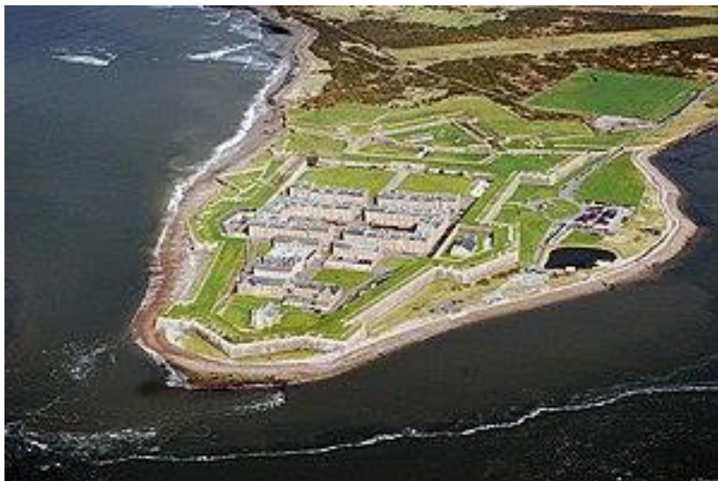
The site from the air

On Tuesday 9 th July at 09:00 our coach company will pick us up from outside the Glen Mhor and we head off for Fort George a short drive from Inverness. This huge fort sits in 42 acres on a promontory jutting into the Moray Firth near Ardersier north east of Inverness. A previous Fort George was built in Inverness in 1726 however during the Jacobite rising of 1745 it was besieged and blown up. In the mid 19 th century the red sandstone building called Inverness castle was built on the site. Following the Jacobite defeat after Culloden the present Fort George was begun, with completion in 1769. The barracks are still a military establishment. Within the compound we find the Regimental Museum of the Queens Own Highlanders (Seaforth and Cameron Highlanders). The late Chief Alastair and his grandfather chief Roderick were both in the Seaforth Highlanders and had been stationed at Fort George.