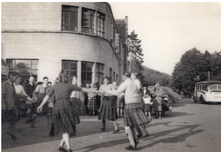
Annual Clan Chisholm Gathering – Saturday 5 th September 1953.

Below is a photograph taken during the 1953 Clan Chisholm Gathering. This shows the newer extension with the older stone built original showing to the east.