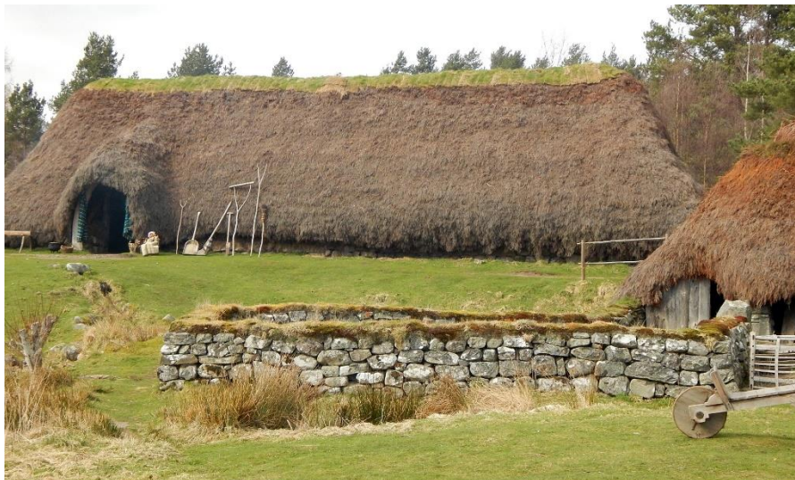
One of the recreated 17 th century buildings

A recreated 17 th century township from before the clearances shows Highlanders living and working.