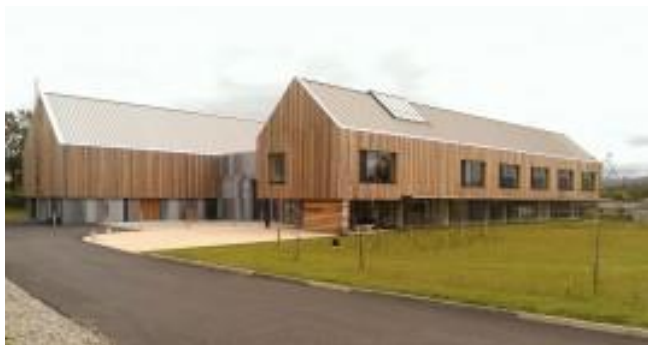
The modern Am Fasgadh facility

Left. The Am Fasgadh (Gaelic for The Shelter) building where we will have lunch houses over 12,000 historical artefacts. We are extremely lucky to have secured a guided tour of the collections.