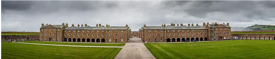
The barracks buildings