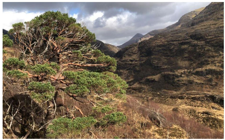
An area of surviving Caledonian pinewood in the Highlands

Trees more than 300 years old are known as "granny pines", and often have lots of dead wood that provides habitat for rare insects.