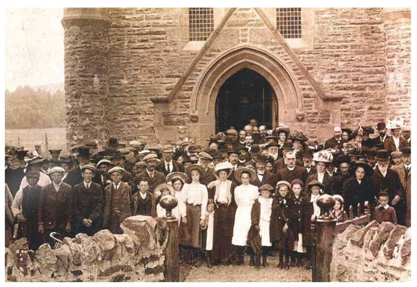
Opening of Free Church at Struy on 1st September 1897

The enquirer was looking for the deeds to the property and wondered if there was a Chisholm or Fraser of Lovat link as most of the land in Struy would have belonged to these two families. The Church of Scotland Head Quarters in Edinburgh could not find the deeds, however after further consultation and enquiries a letter was found from the Church HQ dated 1981 where they confirmed they had the deeds. This prompted a further search in Edinburgh and they were found!