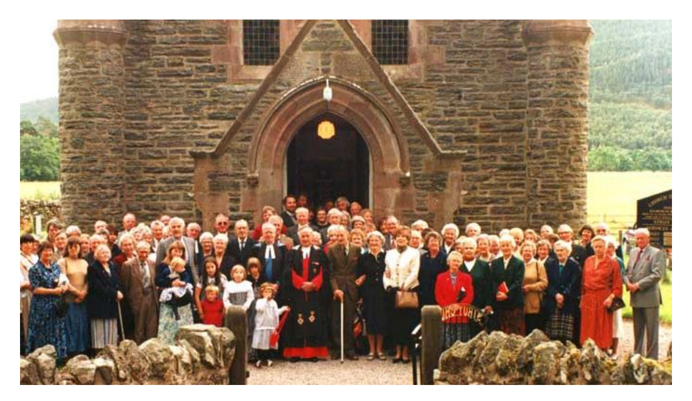
Centenary service 1997

In 1929 the United Free Church reunited with the Church of Scotland at Erchless to form Erchless Church of Scotland. In 1979 the parish was combined with that of Kilmorack and became Kilmorack & Erchless Church of Scotland.