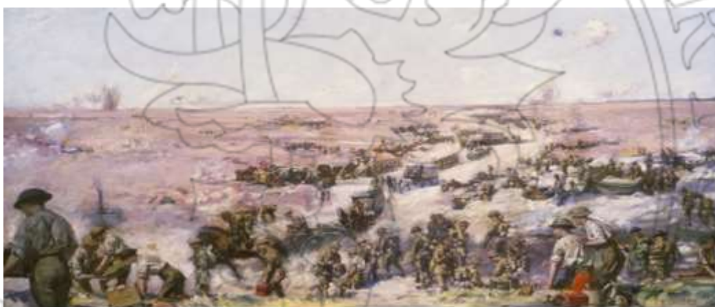
Sausage Valley, Somme (Pozières)

Elsewhere on the Western Front in France, the Loos Memorial in Pas de Calais, has 4 Chisholms.