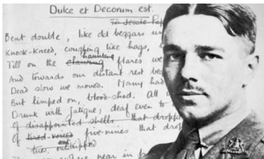
2nd Lt, Wilfred Edward Salter Owen, 5th Bn. Manchester Regiment. KIA 4 Nov 1918

If in some smothering dreams, you too could pace Behind the wagon that we flung him in, And watch the white eyes writhing in his face, His hanging face, like a devil's sick of sin, If you could hear, at every jolt, the blood Come gargling from the froth-corrupted lungs Obscene as cancer, bitter as the cud Of vile, incurable sores on innocent tongues, - My friend, you would not tell with such high zest To children ardent for some desperate glory, The old Lie: Dulce et decorum est Pro patria mori.